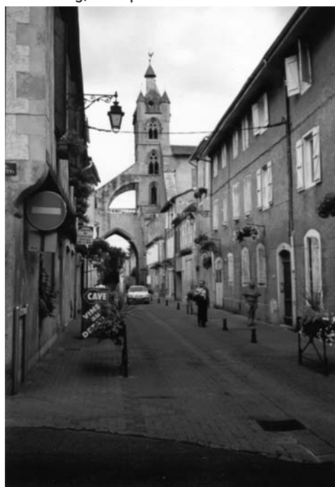
Fig. 4. Mirande, bastide famous through its country music festival. Photo L. Klusakova, 2004

Armous, Cau, Bars, Bassoues, Castelnau d'Angles, Laas, Lamazère; Marseillan; Mascaras; Mielan, Mirande; Monclar sur l'Osse, Montesquiou, Mouches, Pouylebon, St Christaud and St Maur Soules [Communauté de Communes...]. Only two communities in the consortium, Mirande and Mielan, have more than a thousand inhabitants and can thereby be classified as small towns. The Mayor of Mirande is the head of the consortium and the two towns have the strongest say in the organization. Together they collect a special regional tax and both have profited from the effects of festival tourism, which is clear from the growing numbers of paying visitors. Mirande is essential to these activities and has benefited greatly from events related to the festivals.