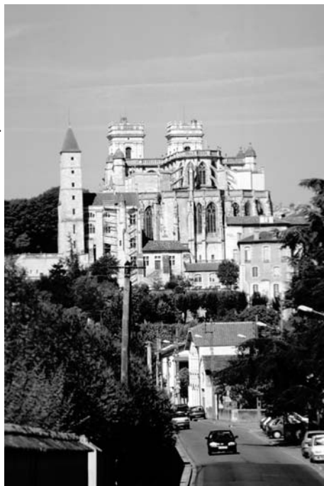
Fig. 9. Auch – St Marie Cathedral is a UNESCO site enlisted within a nomination of French segment of pilgrim trail to Compostella. Photo J.-Fr. Berdah, 2002

Remembrance and historical heritage help to intensify the feeling of collective memory central to the strategies of regional revival and these are drawn on by planners and investors as well as by civic bodies. This exploration of the strategies of small towns and provincial regions suggests that, in small towns, history has a marketable value and can be employed for business purposes. Artistic monuments and historical heritage are used as instruments for enhancing identification and for labelling urban space to facilitate understanding and utilization [Lynch, 1960]. The small town's strategies point also to the importance of emotional relationship between the inhabitants and the place on one hand, and the tourist gaze on the other [Urry, 1995]. This trend towards the instrumentalisation of heritage is most visible in those places, including small towns, which have made it to the UNESCO list of world cultural heritage sites, and indeed UNESCO policy has contributed significantly to this development [Vahtikari, 2017]. The strategies adopted by small towns and provincial regions also demonstrate a need to identify with larger units, imagined national or even supranational communities. This phenomenon is testified to by street names and by museums and monuments commemorating not only local but also national, European, and indeed global history.