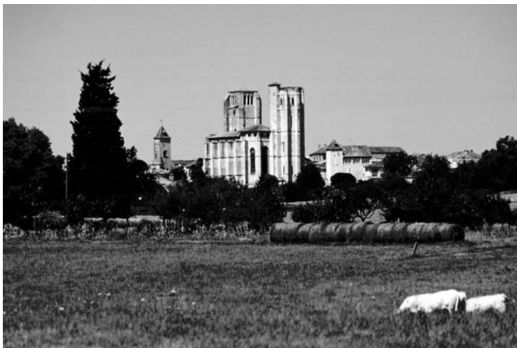
Fig. 11. La Romieu – yet one of the UNESCO WHL sites in Gers. Photo J.-Fr. Berdah, 2002