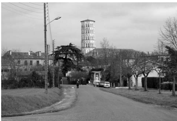
Fig. 8. Lombez – Cathedral in the core is carrier of supranational identification through the memory on F. Petrarca's visit.