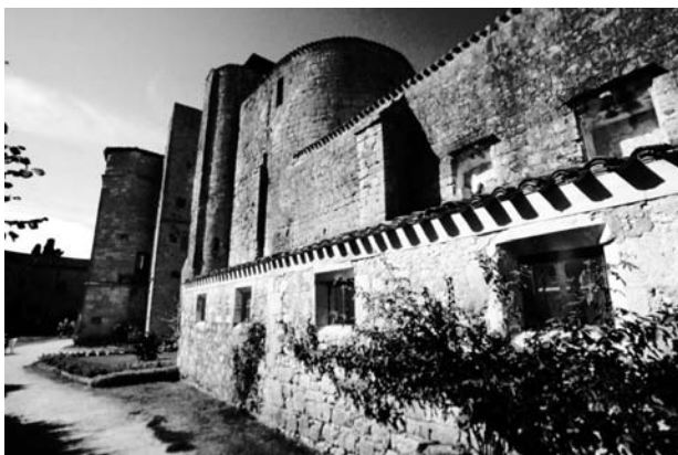
Fig. 10. Available at: Compostella. Photo J.-Fr. Berdah, 2002