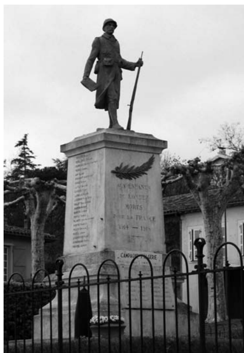
Fig. 5. War memorial "To the children of Lombez who died for France" in Great War, World War II, and also in Algier.

Historical allusion is not confined to public places and printed materials. The landscape also reveals the historical story. Gers is a mountainous region, not far from the Pyrenees and located, it can be said, in the French-Spanish borderland. Its general setting has led to meetings and exchanges with many 'Others'. The interaction stems mainly from the effect of Iberian or Spanish influences and inspiration from across the Pyrenees and the acceptance of sizeable economic and political migration from Spain. In addition, there was a considerable influx of Italians after the First World War, as well as the Pieds noirs – les rapatriés – from Algeria and other former French-African colonies, who settled mainly in the south. Traces of the Huguenot, and Sephardic heritage can also be found, pointing to the legacy of a difficult past. Delving deeper shows that the area was also shaped by northern French efforts to integrate the south into mainstream French culture and by the Roman tradition of written law. [Braudel, 1986, p. 85].