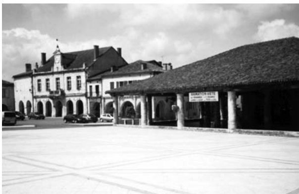
Fig. 7. Mauvezin was a bastide, and a covered market on the square is a typical setting for this type of township. It was and is still a space devoted to community's social life.

With respect to the Gascon culture and mode of life, the most intensive declarative identification is found in Auch, the departmental town of Gers, which has proclaimed itself the capital and heart of Gascony. The Maison de Gascogne hosts exhibitions and promotes the sale of regional gastronomic products, which are all labelled to confirm that they are entirely authentic gascon and representative of the whole region.